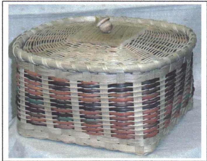
10" x 10" x 6"