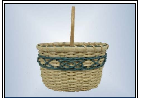
5 1/2" L x 4" W x 4" H w/o handle Intermediate