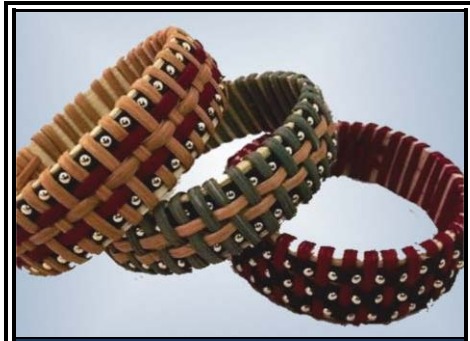
Wrist length x 1" W Advanced Beginner