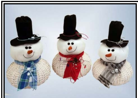
5" D x 12" H Advanced Beginner