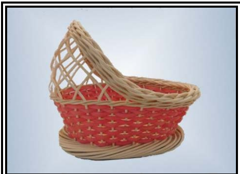
7" L x 5 1/2" W x 6" H Advanced Beginner