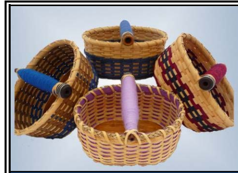
10" L x 6 1/2" W x 5" H w/o handle Beginner