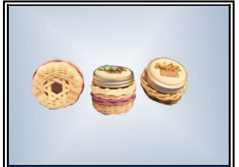
4" D x 3 1/2" H Intermediate