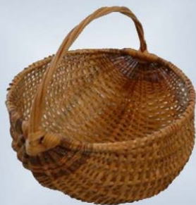
22" D x 20" H w/handle Intermediate