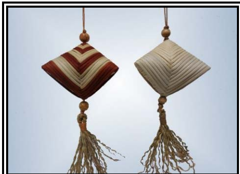
2 1/2" L x 2 1/2" W x 2 1/2" H Beginner