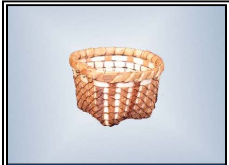
2" D x 1 1/2" H Advanced Beginner