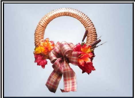
14 1/2" D Beginner