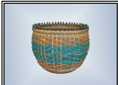
11" D x 8" H w/o handle Intermediate