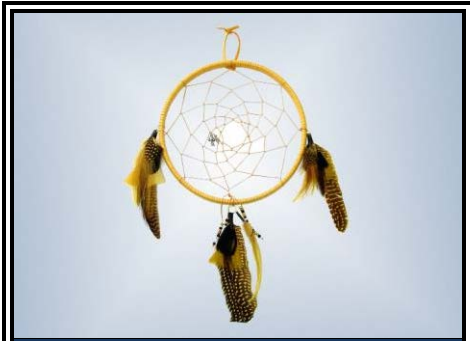
8" D Advanced Beginner