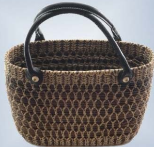
9" L x 4 1/2" W x 5 1/2" H w/o handle Advanced