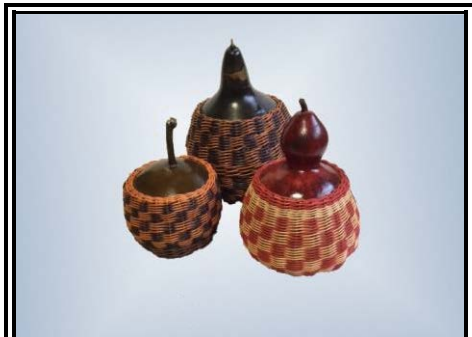
5-8" D x 8"-12" H - Varies with gourd lid size Advanced Beginner