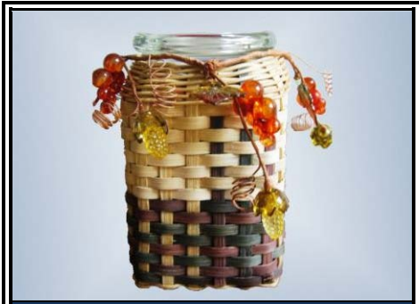
3 1/2" L x 3 1/2" W x 6" H Beginner