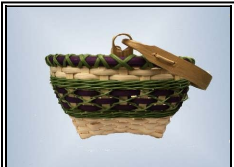
8" D x 5" H w/o handle Intermediate