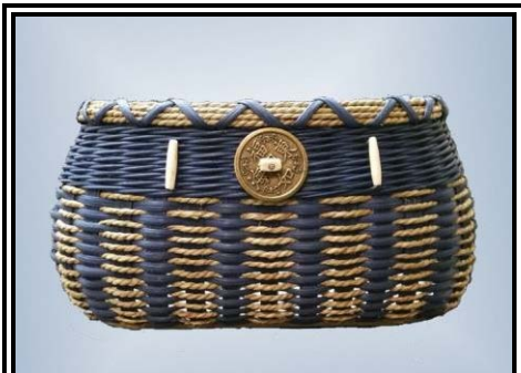
9" L x 5" W x 5 1/2" H Intermediate