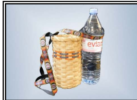
5" D x 10" H w/o handle Beginner